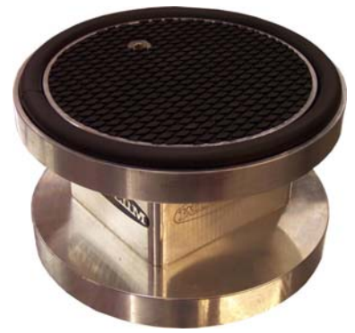
Round Vacuum Pods