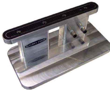
Sink Support Vacuum Pods