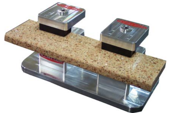
Back Splash Clamps