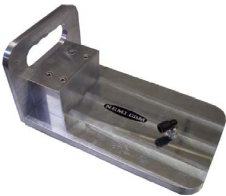
Vacuum Pod Fence