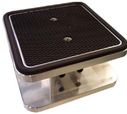
Square Vacuum Pods