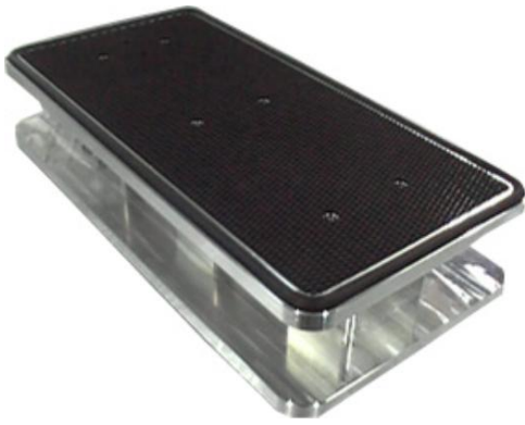
Rectangle Vacuum Pods